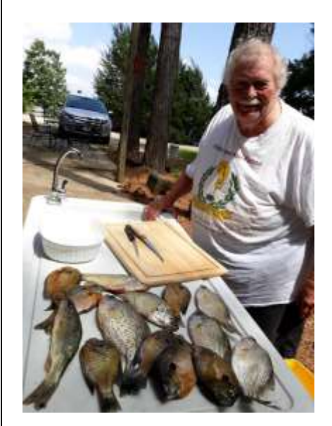
DL's favorite activity - fishing

The following is an excerpt/adaptation from a speech made by Vince Lombardi about the competitive nature of football. Much of it holds true for writing and the effort required to achieve success.