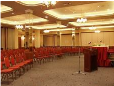
Covid-19 symptom- A lot of empty rooms

Hopefully this year will see the social carnage created by covid-19 fade and die. The damage that was done had multiple levels. The obvious...people dying from the laboratory designed virus. Our older population, of which I am a part, suffered disproportionately. Thank goodness for the rapid development of the vaccine and its distribution. The crippling of our social institutions is a second major level. Cancelling social gatherings even to family assembly has crushed our ability to maintain and protect our normal life processes. It has materially helped those who wish us to believe social control is social justice. Our children pay the price as some (certainly not all) teachers would prefer "vacation" to educating our youth. A third level is the obscene use of the pandemic for political purposes. Each time I think the slime in Washington has found a way to reach its lowest competence, ethics, and filthy corruption...it finds ways to sink to new lows. Is there an end. To the direct effects of the virus? Yes. To the damage done to social institutions, our children, the political system. Not visible. It may take years, if ever, to recover. One only has to look at what was once our great news/media. It has reduced itself to irrelevancy.